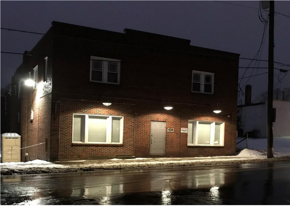
A LIGHT IN THE NEIGHBORHOOD - HOPE FOR RENEWAL FACILITY AT NIGHT