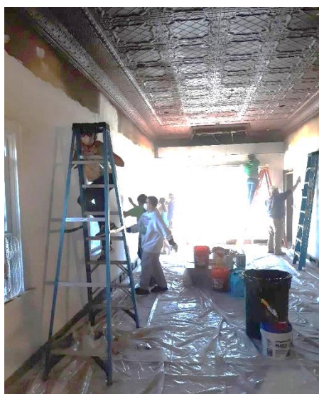
A Job Well Done!