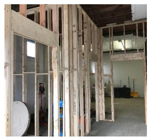
View - Bathroom into Kitchen

The photo on page 1 shows the Café/Meeting Room - the floor has been sanded, the ceiling finished and walls painted and furniture has been delivered.