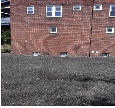
New Parking Lot

Our building has seen some dramatic changes in the last two months. A new parking lot, sidewalk and handicap accessible ramp were installed, and a new water line was installed.