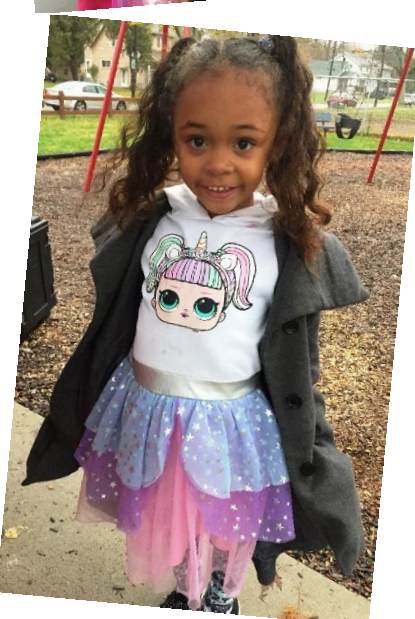
The Hope For Renewal Ministry Center:

Our building has seen some dramatic changes in the last two months. A new parking lot, sidewalk and handicap accessible ramp were installed, and a new water line was installed.