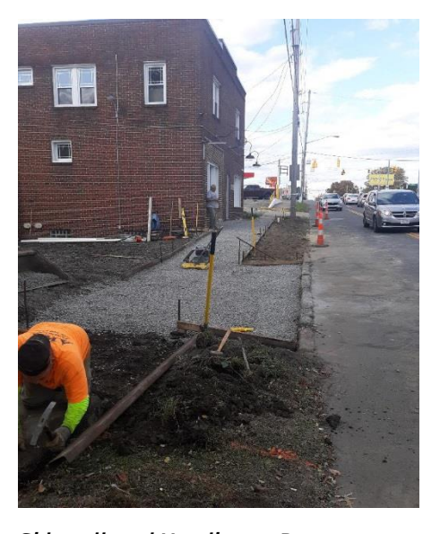
Sidewalk and Handicamp Ramp

The photo on page 1 shows the Café/Meeting Room - the floor has been sanded, the ceiling finished and walls painted and furniture has been delivered.