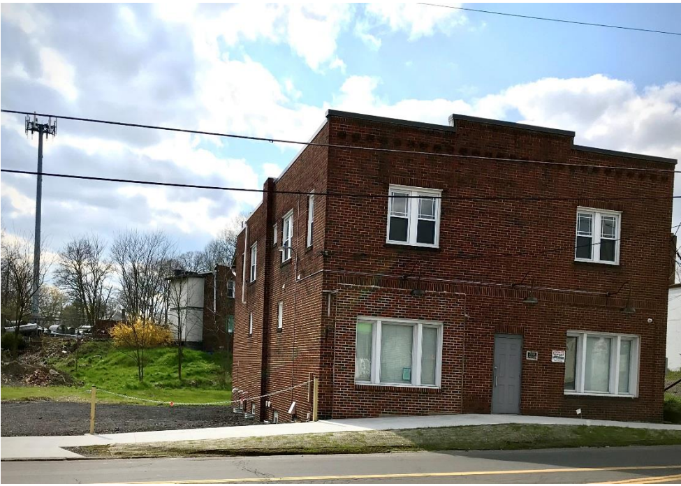
HOPE FOR RENEWAL MINISTRY CENTER ON GLENWOOD AVENUE, YOUNGSTOWN