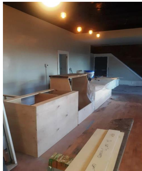
Café Coffee Bar