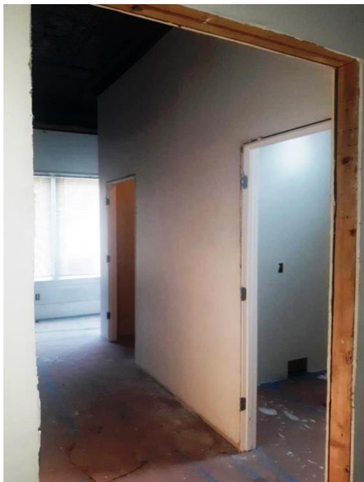
Bathrooms waiting for plumbing