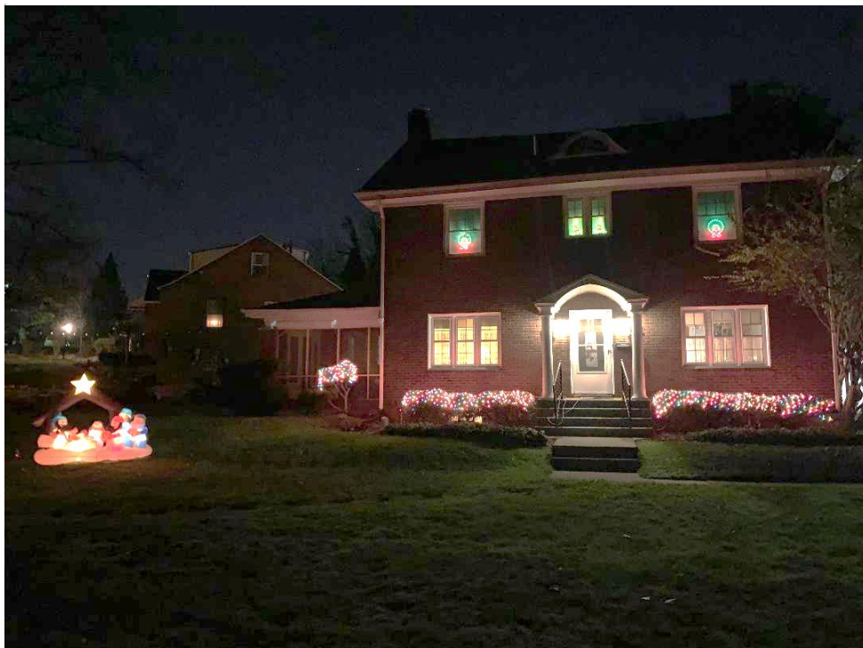
KOERTH HOME ... SHINING WITH THE LOVE OF CHRIST