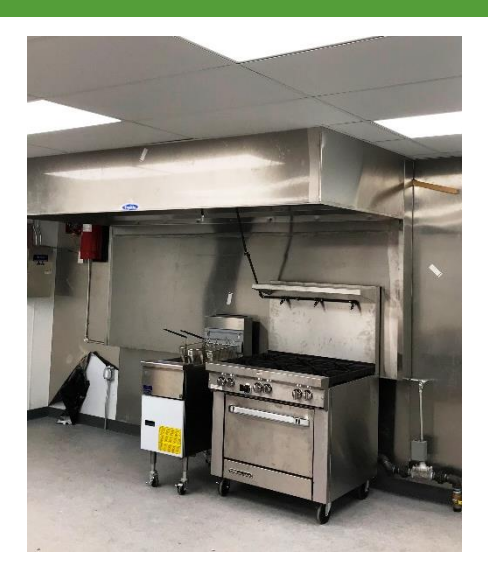
New Kitchen – almost complete!