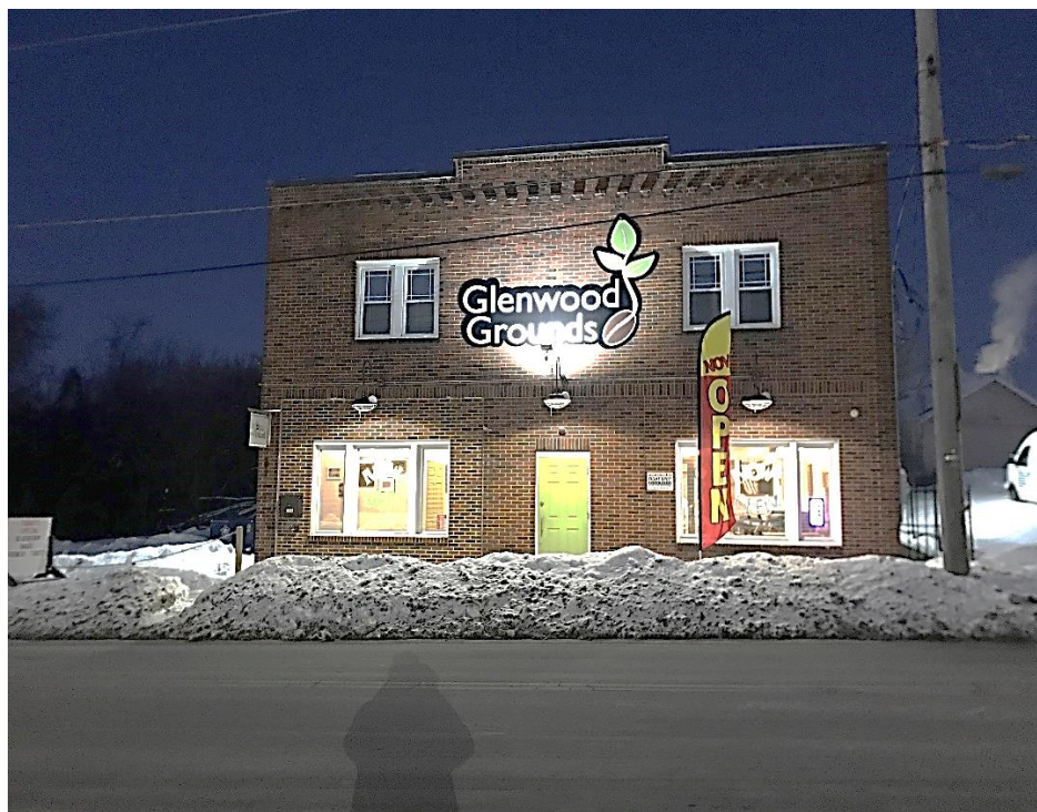
GLENWOOD GROUNDS CAFÉ AND MINISTRY CENTER